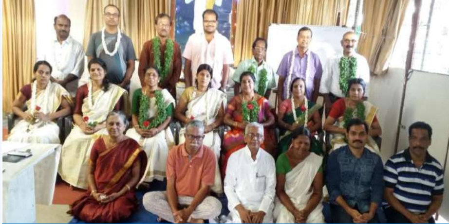
Kayamkulam SKY Trust celebrated Wife Appreciation day