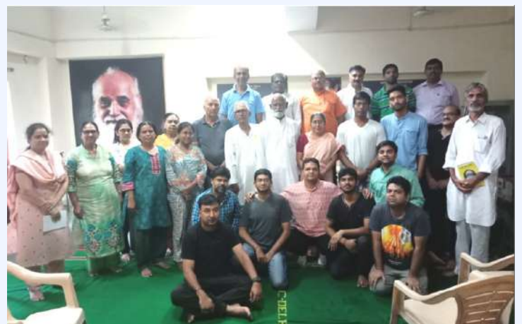
Hindi Foundation Program at Delhi Center - 8 & 9th September 2018