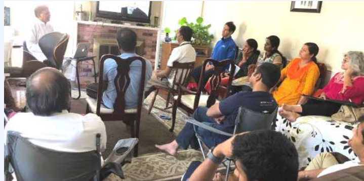
Introspection Course Level - 1 at Bay Area conducted by APTs who got certification recently