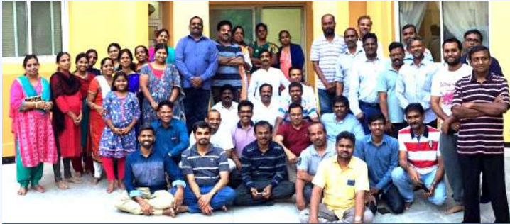
SILENCE on 19th October from 9 am to 5pm, where in 53 participants participated in the SILENCE Program. Natural foods only were served for lunch. 22 women and 31 men enjoyed the silence.