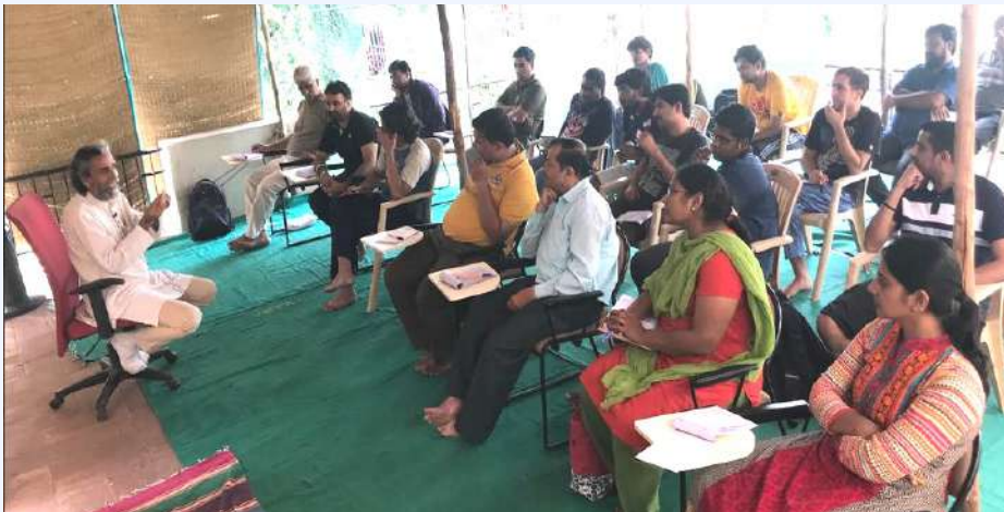
Sky Level 2 participants in Bangalore RT Nagar meditation Center