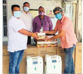
Members of an NGO provide supplies in Kangra on Sunday.

"We plan to distribute 200 more concentrators in the next four-six weeks. These will be made available to government-run facilities in remote locations, PHCs and