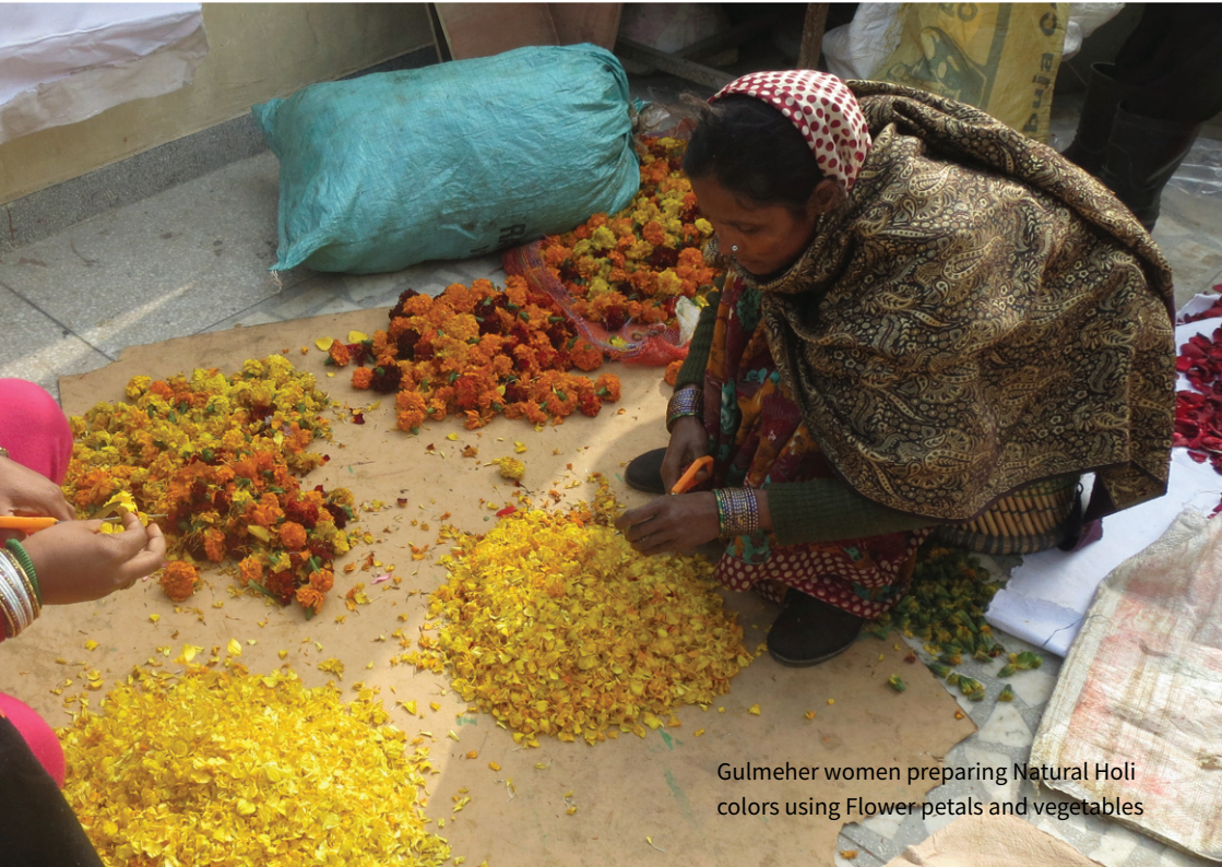
Gulmeher women preparing Natural Holi colors using Flower petals and vegetables

The Gulmeher initiative was born out of a desire to improve the livelihoods and quality of life of the 350 waste-picker households in the slum, focused on initiating alternative income generation. The collective has incorporated Gulmeher Green Producers Company (GGPC), with women waste-pickers as shareholders.