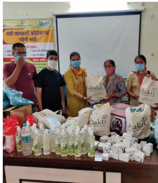
Asha kits distribution at Kalsi, Dehradun

Super Cyclonic Storm Amphan caused widespread damage in Eastern India, specifically West Bengal, Odisha and Bangladesh in May 2020. Through the efforts of local volunteers, dry rations and essential supplies were distributed to over 240 vulnerable families affected by the Amphan Cyclone.