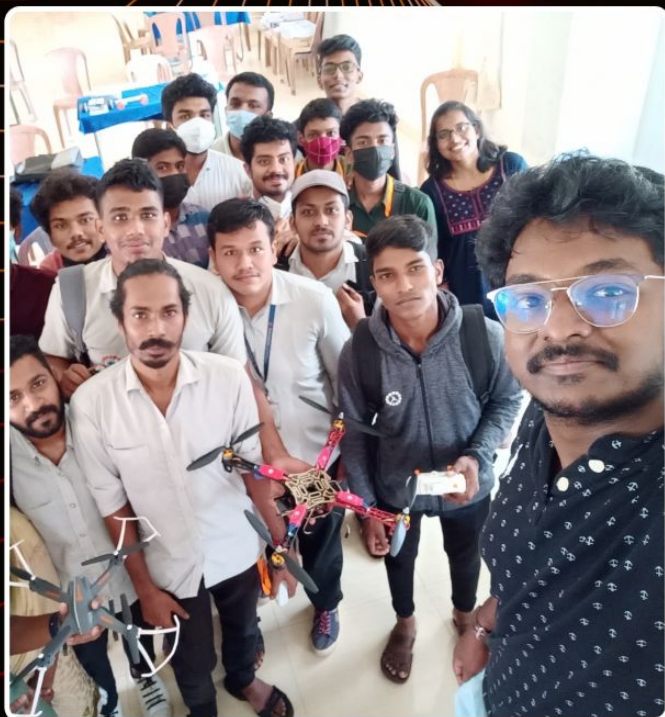
Arduino Day 2022