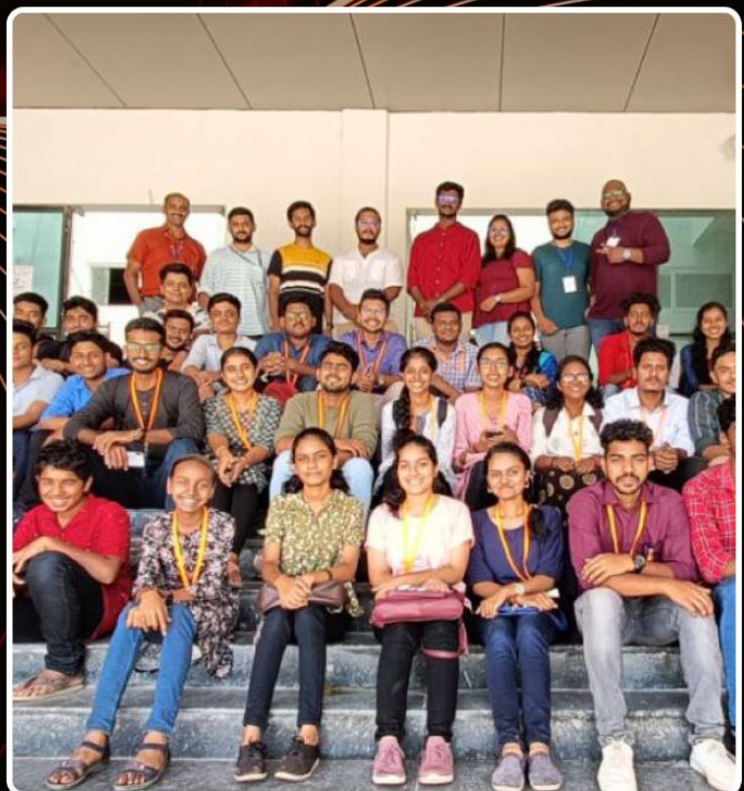
Arduino Day 2023