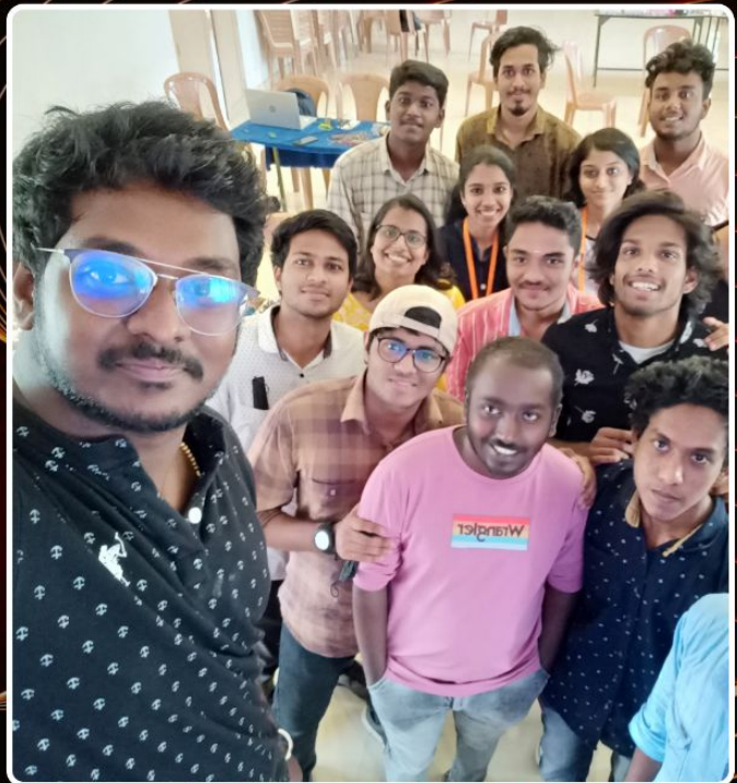
Arduino Day 2021