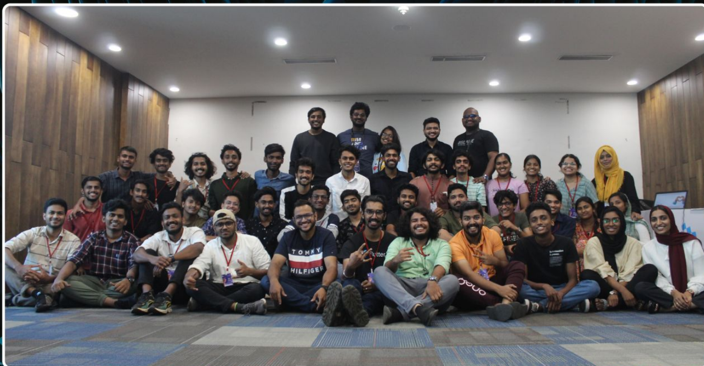
HackARthon Cohort 01, April 2022