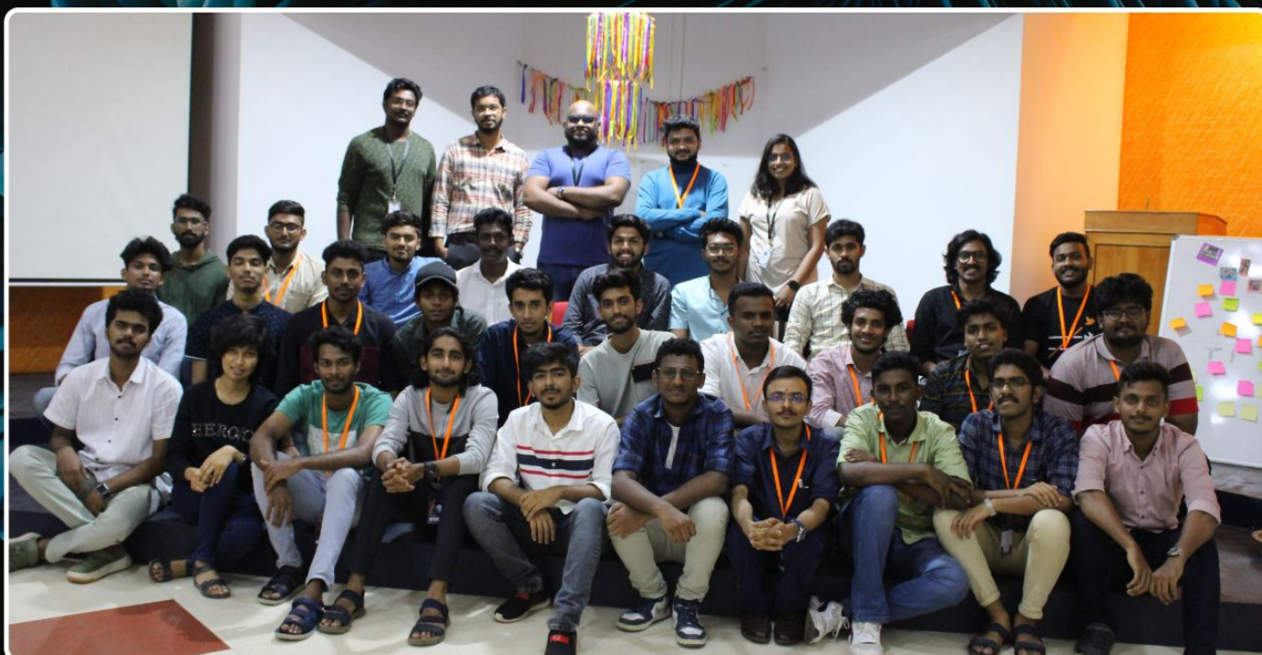
HackARthon Cohort 02, July 2022