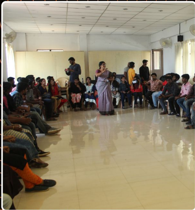
Arduino Day 2019