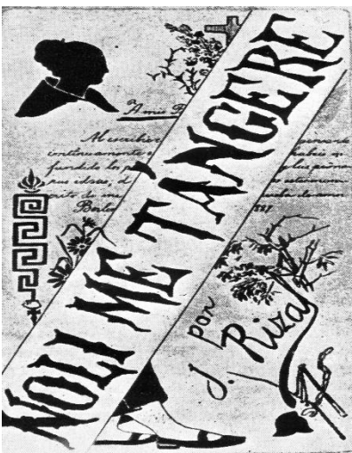
Noli Me Tangere Dr. Jose Rizal

Secondary sources were created by someone who did not experience first-hand or participate in the events or conditions you're researching. For a historical research project, secondary sources are generally scholarly books and articles. A secondary source interprets and analyzes primary sources. These sources are one or more steps removed from the event. Secondary sources may contain pictures, quotes or graphics of primary sources.