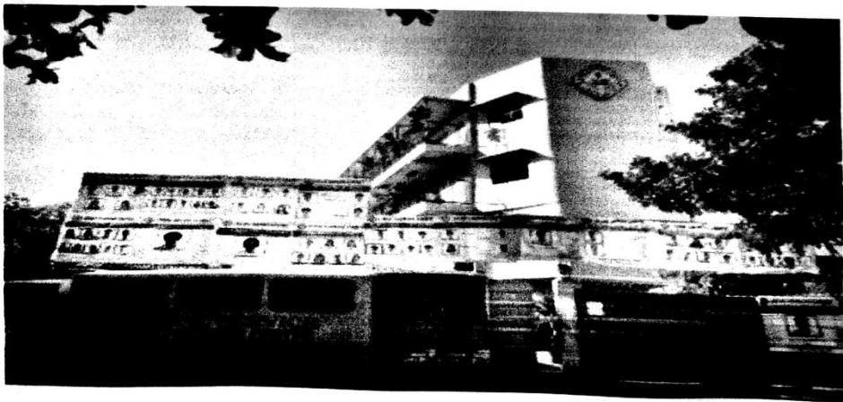
Figure 4: Asian Learning Center: Sangi Rd, Pajo, Lapu-Lapu City