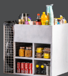
Food & Beverages